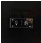
Dimmer Light and ventilation

TWO SIDES SOLID GLASS BACK: CLOSED SOLID BACK | TWO CLOSED SIDES: - SOLID GLASS BACK - SEMI-GLASS BACK | ONE SIDE WITH A FULL GLASS BACK: - FULL GLASS BACK - SEMI-GLASS BACK