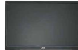
Screen 23,6" (optional)

In a BOOTH XXL smart pod, the recommended time of use is estimated at 1h - 1h30.